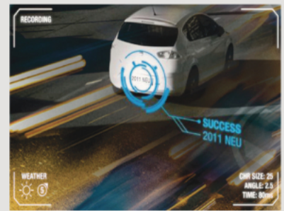
INTEGRATION WITH DMV AND SCNTT DATABASE