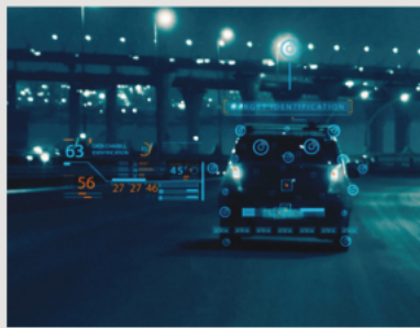
TRANSITS AND TRAFFIC MONITORING