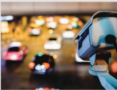
VIDEO SUREVILLANCE AND ANPR MANAGEMENT